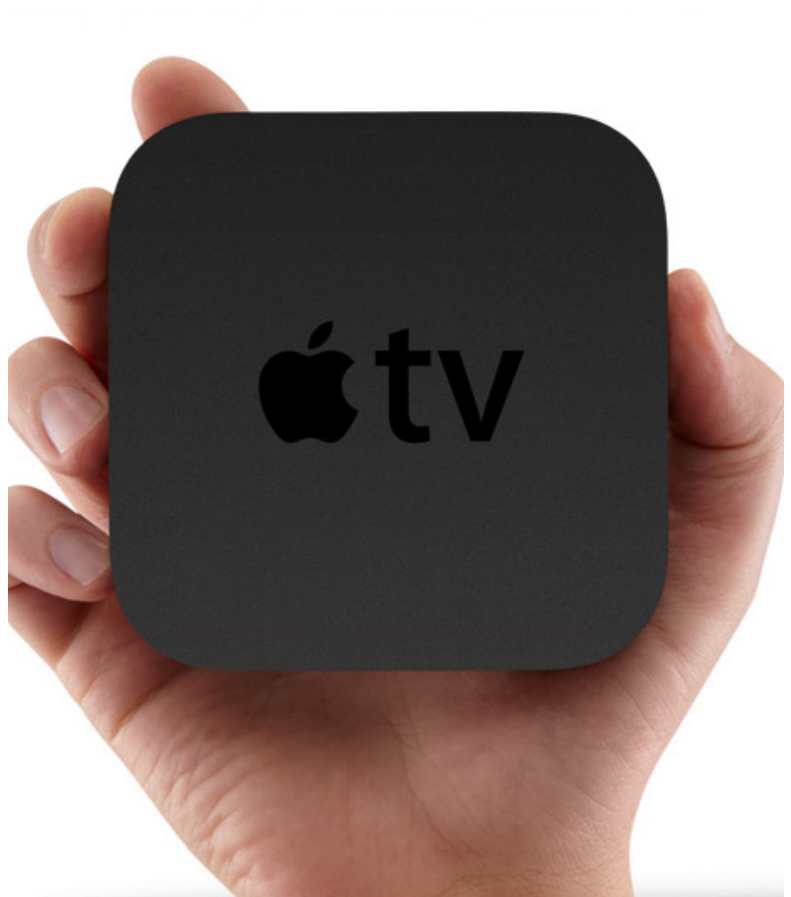
APPLE TV CONTENT IN INDIA