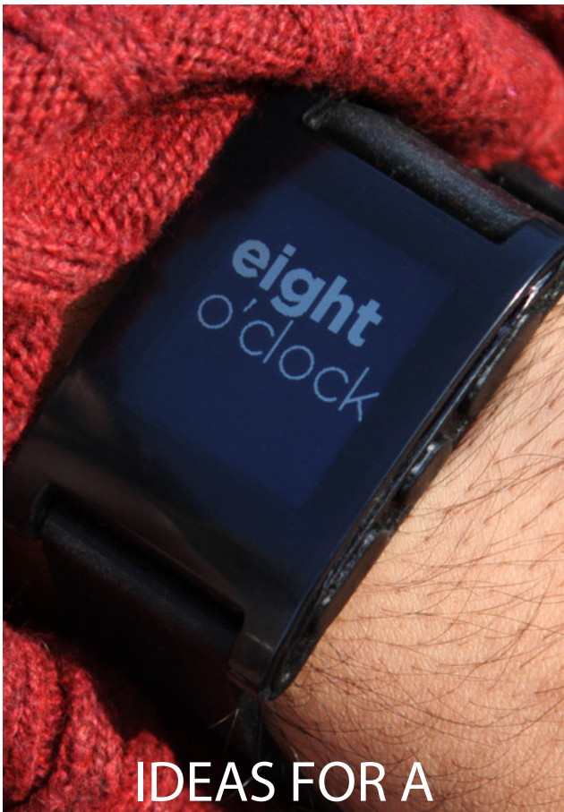
IDEAS FOR A SMART WATCH